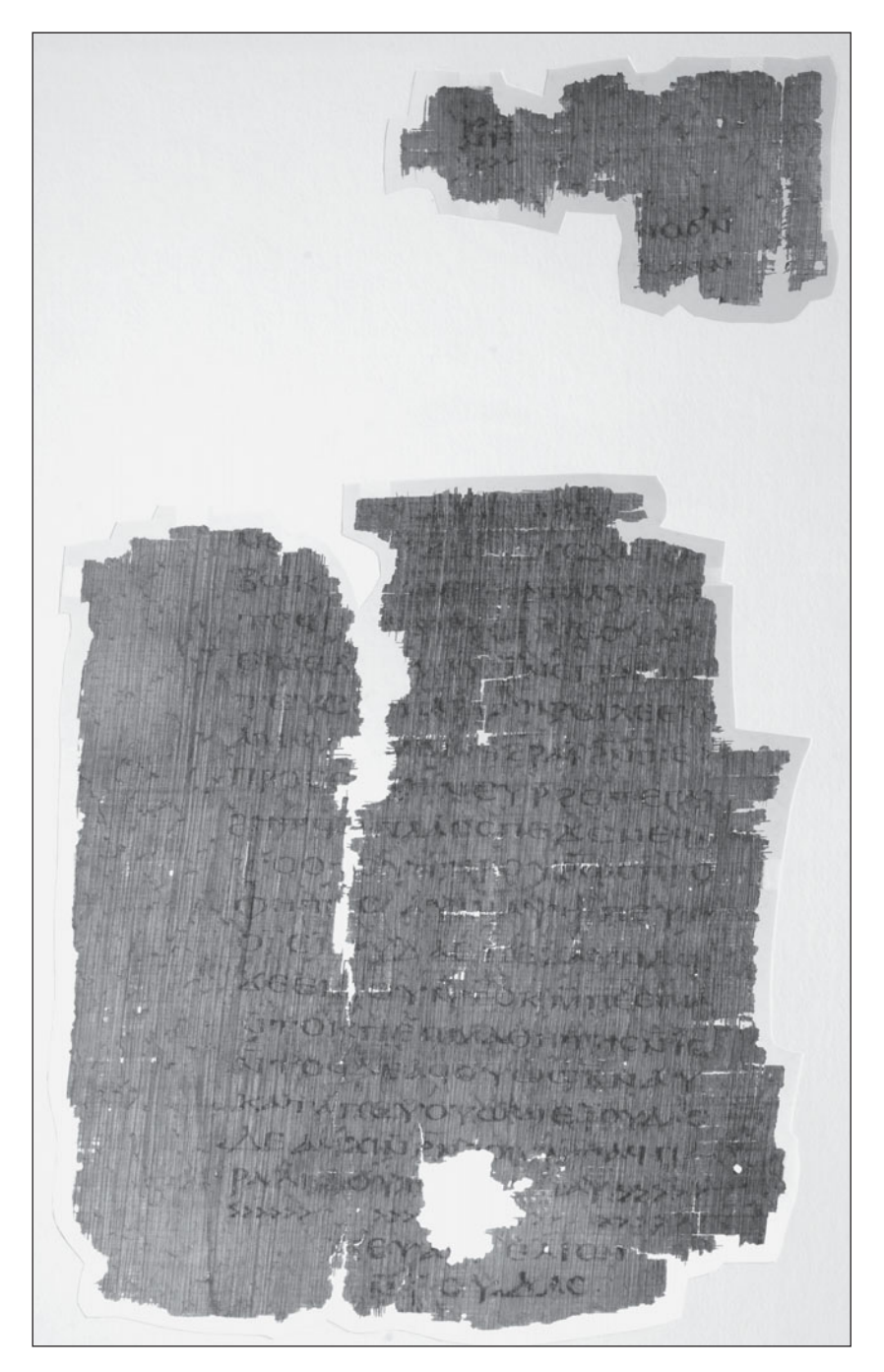
The final page of the manuscript; at the bottom comes the title (which normally concluded a book in antiquity): "The Gospel of Judas."